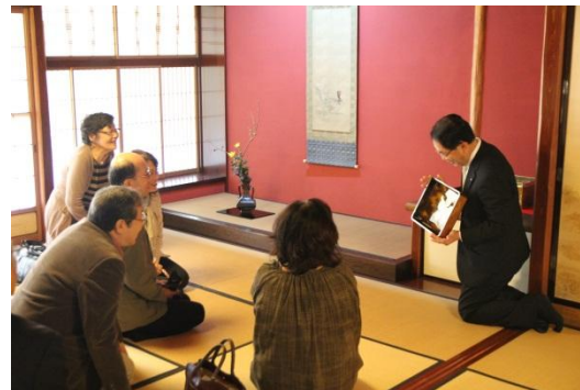
Tourists visiting the residence of the lacquerware shop owner 老舗漆器店店主邸訪問