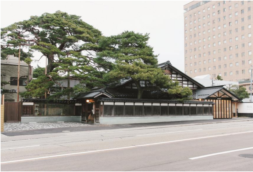
Exterior of the Ohi Museum and Ohi Gallery 大樋美術館・大樋ギャラリー（橋場町） 全景