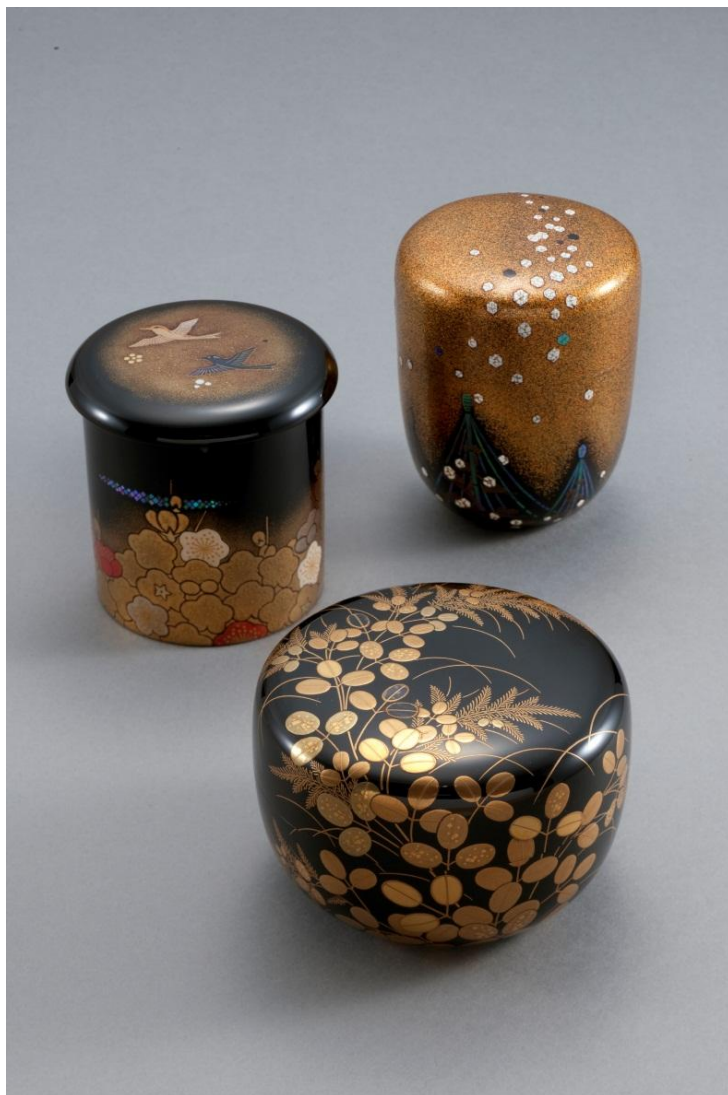
Luxurious gold Kanazawa lacquerware 贅沢に金を施す金沢漆器の数々

The lacquerware shop is located in downtown Kanazawa near Kenrokuen Garden.