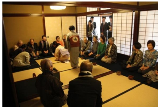
Visitors attending the Ohi tea ceremony 名宝歴代茶盃での呈茶