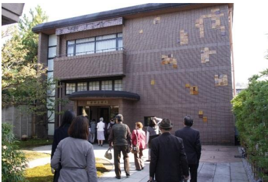
Ohi Museum on the premises 敷地内の大樋美術館