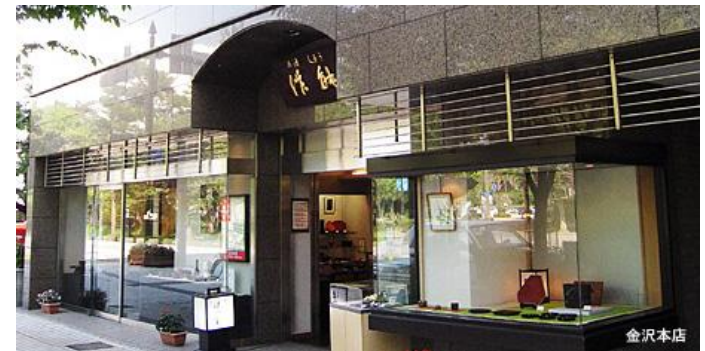
Shopping at the lacquerware store 店舗で買い物