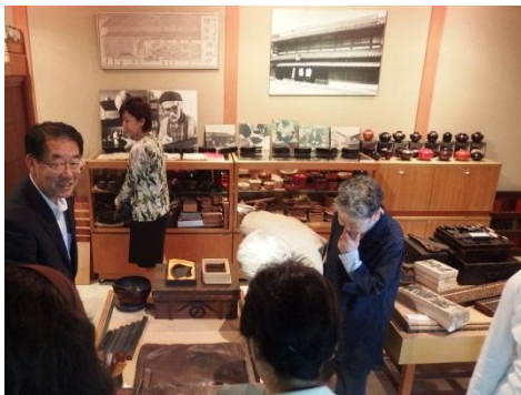
Demonstration by a maki-e artisan in the studio 自宅庭園の工房で、蒔絵職人の実演見学

店主の自宅の庭園にある工房で、蒔絵職人の作業を見学できます。また、自宅から車で15分程度にある金沢市の中心部にある店舗では、日本の伝統的な調度品だけでなく、カップやカトラリー、盆、小箱なども販売しています。