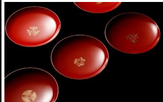
Luxurious gold Kanazawa lacquerware 贅沢に金を施す金沢漆器の数々

The history of Kanazawa Lacquerware begins around 1630, when the third generation daimyo of the Kaga Domain, Toshitsune Maeda, focused his efforts into the promotion of artistic handicrafts. A large majority of Kanazawa Lacquerware is interior furniture, tea paraphernalia, and other original works.