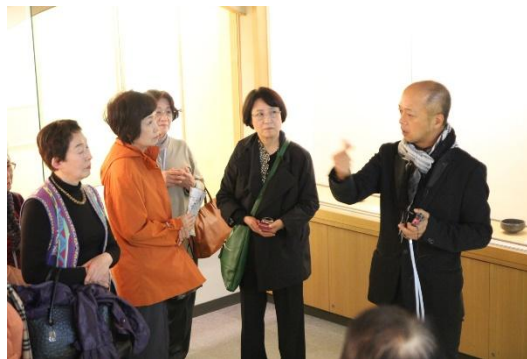
Ohi Chozaemon XI explains the works in the museum 美術館ギャラリートーク