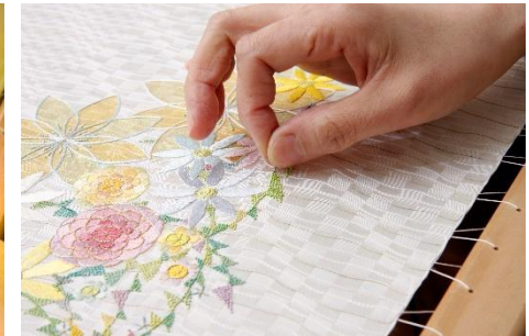
Demonstration at the home studio 自宅の工房で実演見学