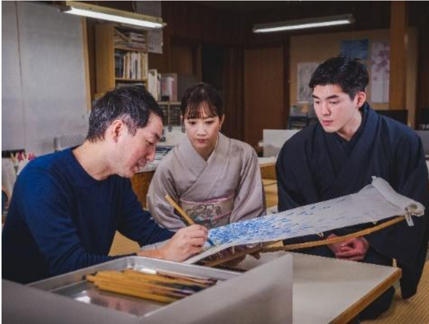
The silk dyeing artist is explaining his technique. 作家による技法解説