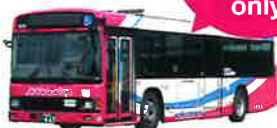
Kanazawa Shopping Bus