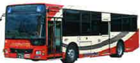
Hokutetsu Local-Line Bus