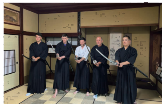
Sword Experience (Shijimaya Honpo)

A sightseeing train of the Noto Railway, a local railroad running along the sea coast of Noto. The interior of the train is decorated with Noto crafts, and the seats are arranged so that passengers can enjoy the scenery. At a station along the way, you will visit a rare railroad postal car which was used until about 35 years ago.