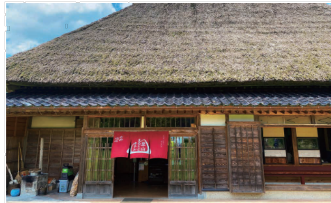
Satoyama Marugoto Hotel

In Kanazawa, you will experience the culture nurtured by the samurai, such as martial arts and tea ceremony. On the Noto Peninsula, you will encounter the lifestyle and customs of traditional farming villages.