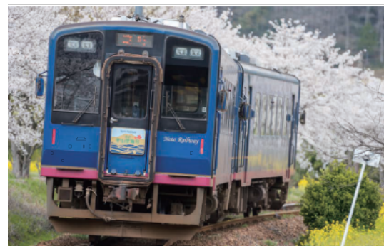
The Noto Satoyama Satoumi Go

Under the concept of seeing the whole community as a hotel, you can enjoy all aspects of Noto lifestyle here. The hotel is run by a young man who moved to Noto in cooperation with local people. In addition to meals, coffee, and lodging, visitors can experience cycling, making Japanese paper, and harvesting vegetables.