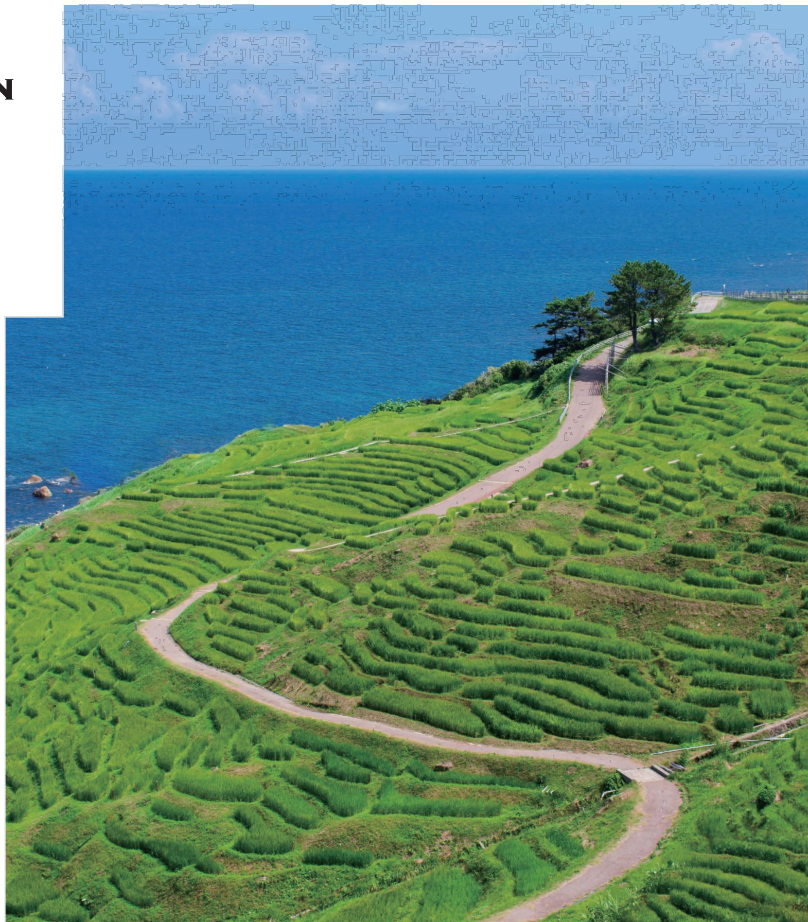
The Shiroyone Senmaida Rice Terraces, a steep slope facing the Sea of Japan, are made up of more than 1,000 small rice paddies, layered one on top of the other, and offer a beautiful scenery in every season.

Kanazawa has a thriving traditional craft culture. There are various craft studios producing a wide variety of works, including ceramics, lacquerware, and dyeing. You will visit the homes of young artisans who are innovating old craftsmanship with new styles and methods.