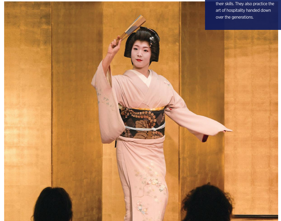
The figure of a geisha dancing in a neatly-worn kimono is the very definition of elegance. Enjoy watching dances where each movement is carefully thought out.

Geisha practice dancing and playing the shamisen daily to hone their skills. They also practice the art of hospitality handed down over the generations.