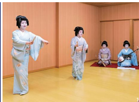
1. Watch incredibly skilled geisha as they dance and play the shamisen. 2. Try hitting a taiko drum in the sitting room to the "Ohya!" call of the geisha.

At a teahouse that generally refuses first-time customers you can listen to a lecture by actual geisha to the sounds of a shamisen, and play a taiko drumming game.