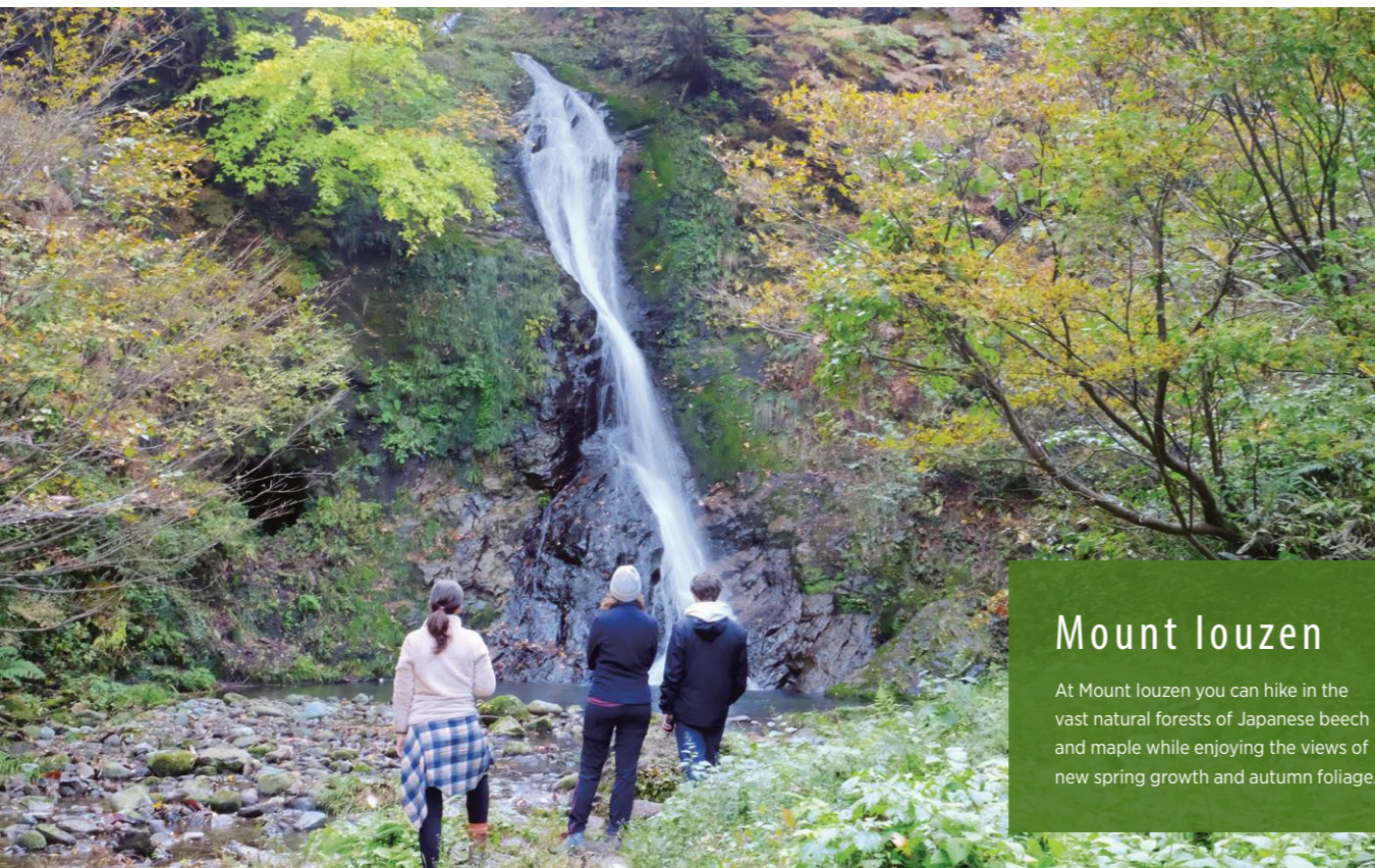
Mount Iouzen At Mount Iouzen you can hike in the vast natural forests of Japanese beech and maple while enjoying the views of new spring growth and autumn foliage.

Mount Iouzen has been known as a part of the mountain faith since ancient times. It is home to sacred places such as Sanjaga Falls, a former training ground for ascetics. Visitors here will feel the abundant nature at Lake Oike which is home to salamanders, and Sanshoku Spring, where the springs change color depending on the season. Enjoy a relaxing time as you refresh your body and soul while walking along the water at the sacred site of Mount Iouzen.