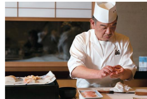
A town with the air of tradition and culture

Kanazawa is a treasure trove of tasty food and sake, including fresh fish from the Sea of Japan and traditional Kaga vegetables. Enjoy watching the expert techniques of a sushi chef across the counter while tasting seasonal fish.