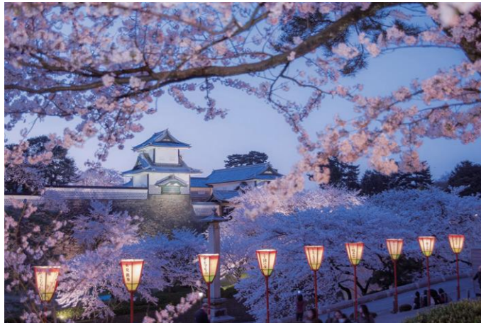
Beautiful seasonal scenery

Cherry blossoms paint the town in beautiful colors in spring. The limited-time nighttime light displays when the flowers are in bloom are popular at Kenrokuen Garden which is open for free at this time, nearby Kanazawa Castle Park, and Gyokusen'inmaru Garden.