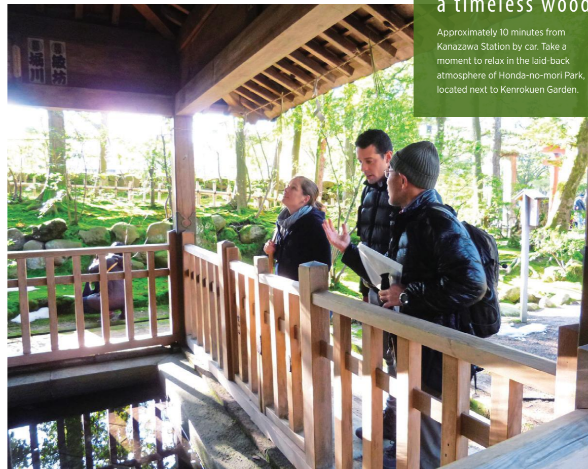
The origin of the name Kanazawa is said to come from Kinjo Reitaku Well.

Forest bathing in a timeless wood Approximately 10 minutes from Kanazawa Station by car. Take a moment to relax in the laid-back atmosphere of Honda-no-mori Park, located next to Kenrokuen Garden.