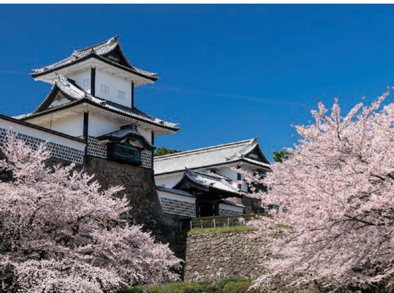
Kanazawa Castle, in which the Maeda family used to reside, is now maintained as a park.