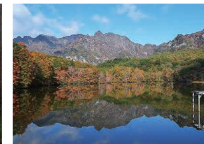
The Kagami-ike pond at Togakushi Kogen, which is a popular sight for autumn leaves.