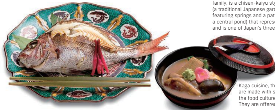
Kaga cuisine, the traditional kaiseki dishes which are made with seasonal ingredients and reflect the food culture of the castle town Kanazawa. They are offered at ryotei restaurants in the city.