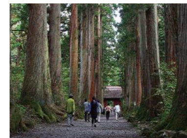
The people's temple, which accepts everyone regardless of religious sect, has been visited by a large number of pilgrims since the olden days.

Togakushi Shrine which sits at the foot of Mt. Togakushi. The shrine approach with an array of cedar trees is wrapped in a tranquil air.