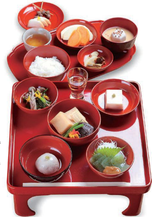
"Shojin Ryori," made mostly with cereals and seasonal vegetables, is traditional Buddhist cuisine. The simple dishes bring out the best of the ingredients. They are offered at inns and eateries as a speciality of the Zenkoji temple town.

now be reached in just one hour from Nagano. Kanazawa and Nagano - the two cities that were connected by historic highways - are now linked by a new Shinkansen route, and are expanding the enjoyment of sightseeing.