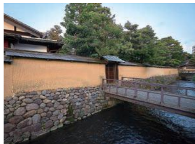
The Nagamachi Buke Yashiki District in which samurais used to live during the Edo period. The cobbled streets with earthen walls create a traditional atmosphere.

With a kokudaka of one million, the Maeda family used their strong financial power for civilian policy, and established the foundation of the present Kanazawa, where arts and crafts thrive. Kanazawa escaped any damage caused by war or major disasters, and retains a number of relics as well as the atmosphere and culture of the castle town.