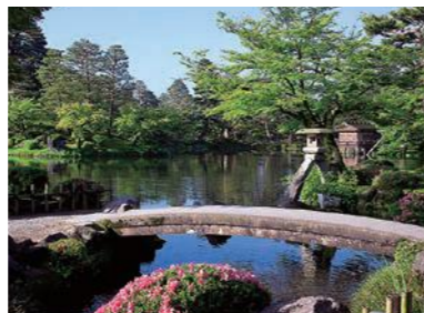
Kenrokuen Garden, developed by the Maeda family, is a chisen-kaiyu style garden (a traditional Japanese garden design featuring springs and a pathway around a central pond) that represents the Edo period and is one of Japan's three greatest gardens.