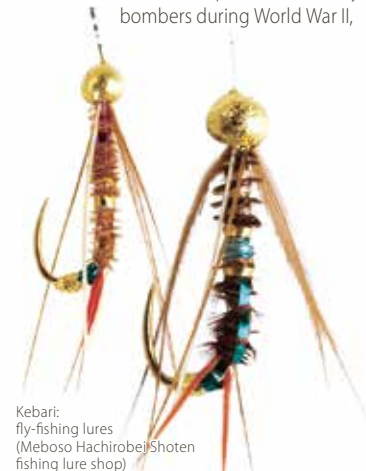
Kebari: fly-fishing lures (Meboso Hachirobei Shoten fishing lure shop)

Kanazawa has maintained its otherworldly charm, from the remains of Kanazawa Castle down into the picturesque geisha and samurai districts. Centered around the area known as Nagamachi located at the foot of the castle, former samurai homes are tucked away behind thick ochre mud walls topped with distinctive clay or wooden tiles. During Kanazawa's snowy winters, woven straw mats protect the walls, designed to prevent freezing and splitting. Private entrances shield modern