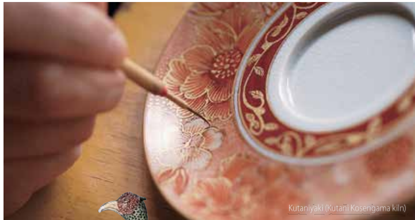
Kutaniyaki (Kutani Kosenigama kiln)