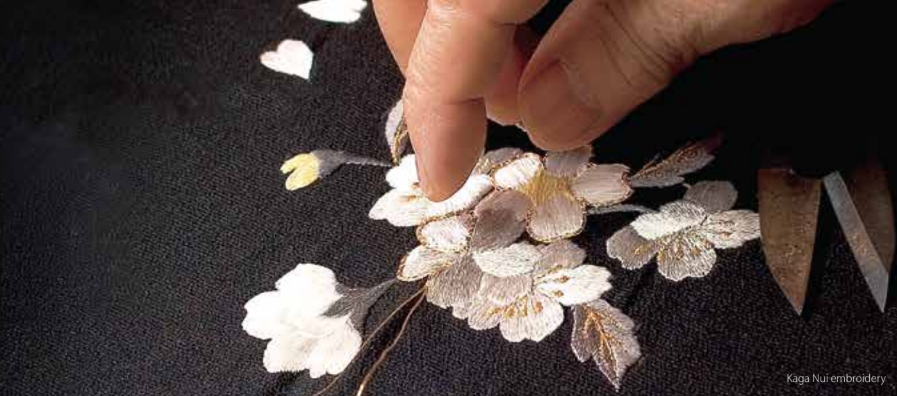
Kaga Nui embroidery