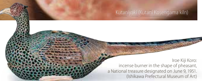
Iro-e Kiji Koro: incense burner in the shape of pheasant, a National treasure designated on June 9, 1951. (Ishikawa Prefectural Museum of Art)

Just down the street, you'll find the Museum for Traditional