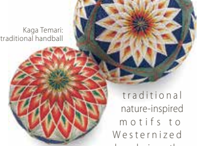
Kaga Temari: traditional handball

traditional nature-inspired motifs to Westernized modern designs, the