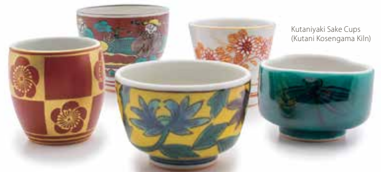
Kutaniyaki Sake Cups (Kutani Kosengama Kiln)

Sharing the same vivid Kaga gosai palette is the ceramic tradition of Kutaniyaki. For over 200 years, their artisans have created fantastic, often decadent tableware, often incorporating generous helpings of gold as well. Used for everything from ceremonial occasions to home décor, Kutaniyaki has been collected and passed down for generations, even as contemporary artisans work to sustain and revitalize the line. From