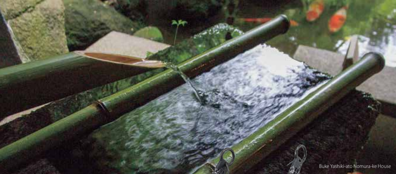
Buke Yashiki-ato Nomura-ke House