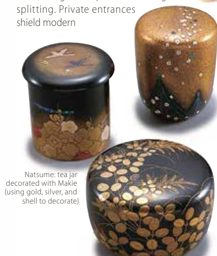
Natsume: tea jar decorated with Makie (using gold, silver, and shell to decorate)