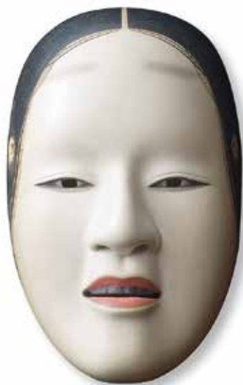
Noh Mask

A later Maeda descendant also encouraged learning by inviting Confucian scholars to Kanazawa, and publicly supported the collection and preservation of the classics, earning Kaga the reputation as being "the