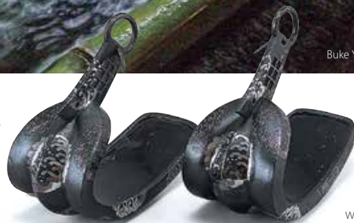
Abumi: stirrups with Kaga Zogan decoration

occupants from curious passers-by, but fortunately there are several residences and shops open to the public where visitors can experience the striking architecture and refined taste of these multi-faceted fighters.