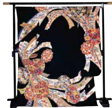
Kaga Yuzen Kimono

government, forcing it underground until an official license was granted in 1845. Today, Kanazawa accounts for 99% of the gold leaf produced in Japan, although much of the raw material is now imported. While the Maeda family