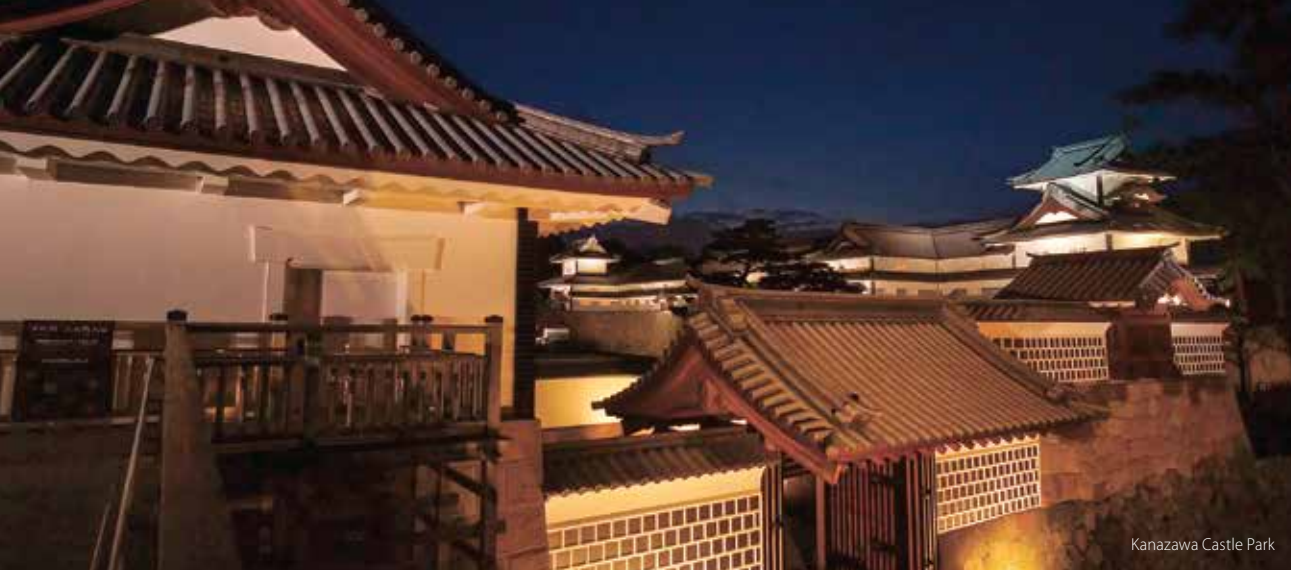
Kanazawa Castle Park

library of the realm." He also completed a project of an earlier daimyo who had transformed the armory into a workshop for producing industrial arts by expanding its parameters to also include paper, metal work, lacquer, bamboo, clothing, ceramics, and gold leaf.