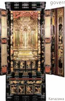
Kanazawa Butsudan Buddhist Altar